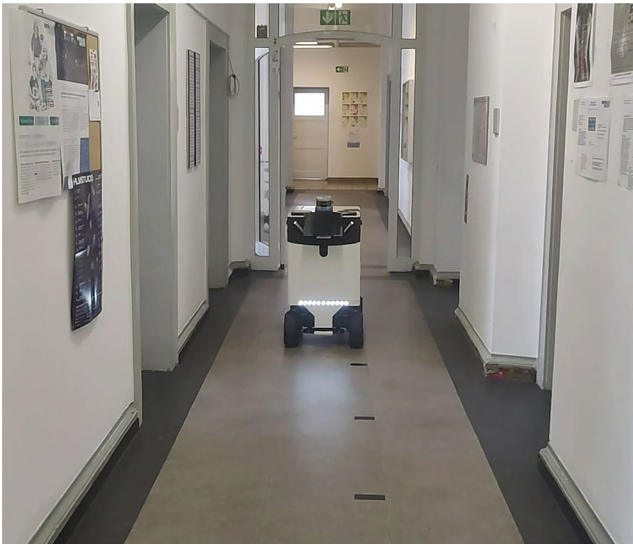
Fig. 2 The delivery robot in the hallway. This is a screenshot image from the videos shown to participants

The videos were recorded in a corridor that was about 12 meters long and 2.1 meters wide (see Fig. 2). The robot was placed at the end of the corridor, driving toward the camera. We made sure that the robot was at the desired speed at a predetermined point in the hallway. We edited the videos to start when the robot reached that point. This helped to increase the consistency between conditions. One camera A was hand-held and walking toward the robot at 0.84 m/s (3.02 kph, see Fig. 2). By using a metronome, we aimed to keep the step speed and thus the movement speed of camera A constant. We used a secondary camera B that was placed stationary in the hallway behind camera A . The footage taken by this camera was used to determine the distance between camera A and the robot by using the markings on the floor. Camera A and the robot moved at a constant speed, so we were able to calculate their distance when a participant pressed the button based on the timestamp of the video by using the time and speed. Only the videos captured by camera A were shown to the participants and 7 videos were made with a delivery robot driving at 7 different speeds (from 1 mph (1.61 kph) to 7 mph (11.27 kph), see Table 1).