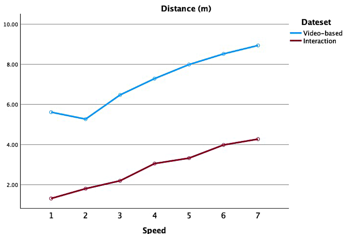
Fig. 4 Differences between two datasets on passersby's preferred signaling distance in different speed conditions

with a delivery robot at different speeds. The study results support our hypotheses that the robot's speed correlates with the preferred signaling distance and can be used to predict when a user would need a navigation cue from the robot to feel safe (H1). In addition, speed is correlated with perceived comfort and safety. However, we did not find significant results concerning participants' characteristics and influence on these processes (H3). Finally, our results suggest that human perceptions of speed through watching a video and watching it in real life are different. In the following, we discuss the results of both studies separately as well as in comparison.