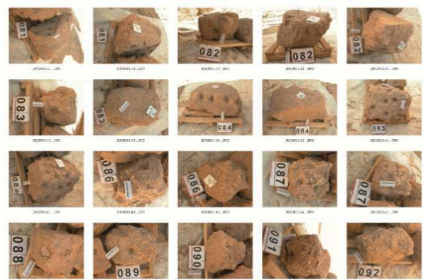
Figure 8. Example of salvaged fragments originating from the 38m Buddha with visible sculptured rock surface

Since both Buddha figures had been originally hewn out of a conglomerate rock surface with a specific sedimentological structure, a paleo- and rock-magnetic methodology is suitable to aid in the relocation of fragments of the giant Buddha figures. Correlation of lithological details from the rear side of the Buddha niches to those of the blasted rock fragments has been tested to determine the relative position of the fragments towards the rear side of the niche. Magnetic susceptibility (i.e. the ratio of the magnetization in the rock fabric to the corresponding magnetizing force) was measured, and susceptibility profiles at a spacing of about 5-10 cm were determined perpendicular to the bedding of the rear niche wall (Figure 9). The combination of the rock magnetic and geologic methodology is capable of identifying the original position of fragments of the destroyed Giant Buddha figures and has elsewhere been successfully tested in the field for fragments larger than 1m (Urbat, 2009).