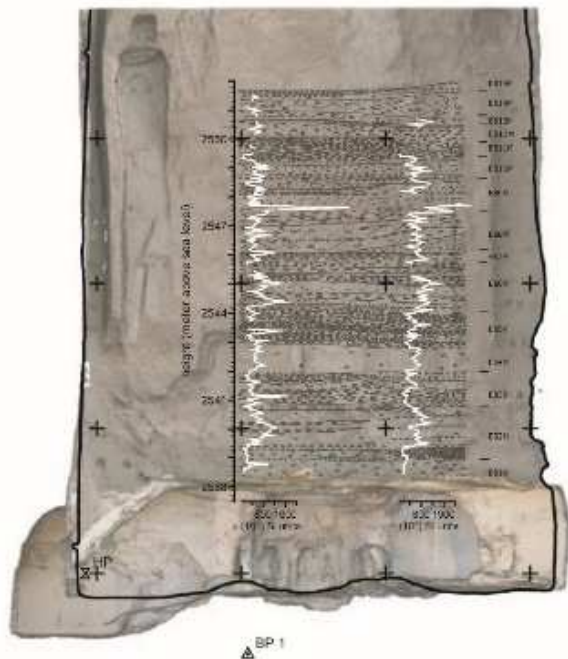
Figure 9. Geological Mapping of the rear side of the 38m Eastern Buddha niche (Urbat 2009)

Cultural Heritage has become a key asset during conflict and also post-conflict situations. The case of Bamiyan appeals urgently that debate about reconstructing heritage places is missing a key point when it is merely focused on the matter of material design and available resources – since it is the re-visioning and reconstruction of people's identities that is essential in this process.