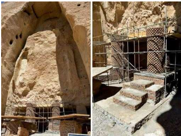
Figure 2. Situation at the bottom of the 38m Buddha niche by end of 2014

However, a critical self-evaluation after fifteen years has to conclude that this coordination mechanism reaches its limit when it is not able to achieve mutual consensus among its members. A crucial controversy about the future presentation of the main Buddha cliff turned out to be the key debate, unsolved to date. The arguments are bouncing between two poles: either leaving the site as-is, empty niches as a kind of war memorial, or attempting to rebuild part or all of a figure, a standpoint taken by the Afghan government and backed intensely by the local population – to have at least one figure revived from the ruins as an act of symbolic resurrection. Due to the still required intensive consolidation of the niche rear wall, this cannot be pursued for the Western (55m) Buddha for the foreseeable future. The situation at the Eastern (38m) Buddha niche is considered more promising by the promoters of the second line of thought. A protective canopy for visitors to the rearward caves in the eastern niche, preventing fall of small stone pieces, was pursued by the restoration team of the Technical University of Munich. It led to the construction of two reinforced pillars exactly on the location where once the “feet” of the original 38m Buddha stood.