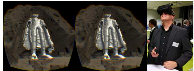
Figure 5. Stereoscopic rendering as shown via a head mounted device (HMD – Oculus Rift DK 2)

node visualization cluster with 48 GPUs of the latest generation. The high level of immersion and an illusion of presence achieved are unique. Due to its capacity to accommodate up to five people, it opens up entirely new ways of collaborative interaction in virtual environments. The computational skills required for the design and implementation of an application in the programming language Lua are a drawback of such a multi-purpose technical framework. Regrettably, applications realized in a more commonly used programming or gaming-framework (e.g. Unity ) still lack the required cluster support and cannot be displayed in this environment.