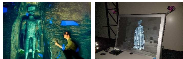
Figure 6. (left): Immersive 3D aixCAVE System (right): infrared head-tracked 3D workbench 5

For the purpose of the current study an application is being designed that allows for an easy navigation within a scene composed of a model based on a) laser scan data of the entire Bamiyan cliff, b) laser scan data of the eastern 38 Buddha niche, c) digitally reconstructed caves at the bottom of the rear wall, and d) the digital model of the 38m Buddha previously reconstructed from historical iso-line drawings. From this model, several instances show different aspects expressed by varying texture and geometry characteristics. Several cleaning, meshing, and simplification operations are required for reducing the complexity of the digital models in order to ensure reasonable frame rates across the different stereoscopic 3D visualization environments, especially the head-mounted device. This allows for a smooth visualization and good immersive experience of the entire scene; if required the originally colored 3D laser scan data set can always be activated to describe the complex geometry of the cliff in more detail at the cost of a significantly reduced frame rate.