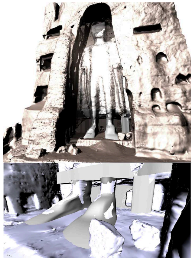
Figure 3. Simulation of the situation around the virtually reconstructed feet of the 38m Buddha statue with simplified model of the niche modeled in Autodesk 3ds Max

Digital reconstructions of the destroyed Buddha figures have been explored since 2001 using a variety of techniques and methods. Photogrammetric procedures including algorithmic detection of surface geometry from historical pictures for both the 55m and the 38m Buddha (Grün et al., 2004; Grün and Hanusch, 2008) emphasized the methodology for generating high accuracy digital models entirely based on image matching methods. In contrast, a combination of methods for supporting conservators and engineers with detailed plan material during the ongoing conservation works within the UNESCO Safeguarding project has been followed by (Toubekis, 2009).