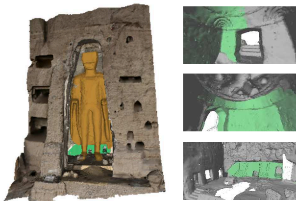
Figure 7. (left): Digital reconstruction of the 38m Buddha in yellow color - (right): series of illustrations on the reconstructed cave complex in green color superposed on the digital model of the niche

The use of virtual reconstructions in the context of physical restoration projects has been shown for a historic city gate by (Almagro, Vidal et al., 2015), to facilitate interpretation to the general public of complex geometric, spatial, structural and temporal relationships with information originating from a variety of sources (i.e. laser scan, historical plans and pictures). Digital augmentation of measurement data from complex heritage sites for building phase visualization facilitates interdisciplinary research and the level of understanding of archaeological findings for the general public (Landes et al., 2015). Possibilities of Virtual Anastylis based on computation analysis of fragments have been demonstrated in the domain of Archaeology, relying on identification of significant Roman column fragment features that can be indexed in a hierarchical manner (Canciani et al., 2013).