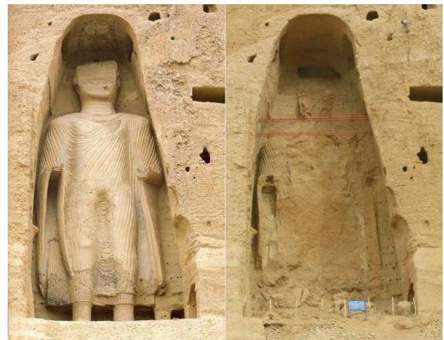
Figure 1. “Small” 38m Eastern Buddha of Bamiyan before the destruction and empty niche in 2004

A survey team from the National Research Institute for Cultural Properties (NRICP) from Tokyo and Nara set up the coordinates for a permanent site reference system and produced a detailed landscape map from aerial pictures of the 1970's (Yamauchi et al., 2012a) and a detailed topographic map of the recent central Bamiyan valley. This also included 3D laser scans of the main cliff, the niches of the Giant Buddha's and several caves, in order to document the condition after the detonation, and to prepare site plan material for the next stages of the program including geophysical archaeological prospection to determine the extension of buried archaeological remains (Yamauchi et al., 2012b). The Japan Centre for International Cooperation in Conservation at NRICP initiated a comprehensive conservation intervention in selected cave structures in order to prevent further deterioration of the mural paintings based on a well-documented extensive damage assessment (Yamauchi et al., 2014, 2013). The scientific analysis revealed many new findings leading to a revised understanding of the way the cave settlement grew, and