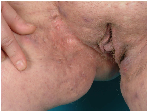
Figure 6 Bilateral Hidradenitis suppurativa (Hurley's Staging III) in the perianal, perineal and mons pubis showing the right side.