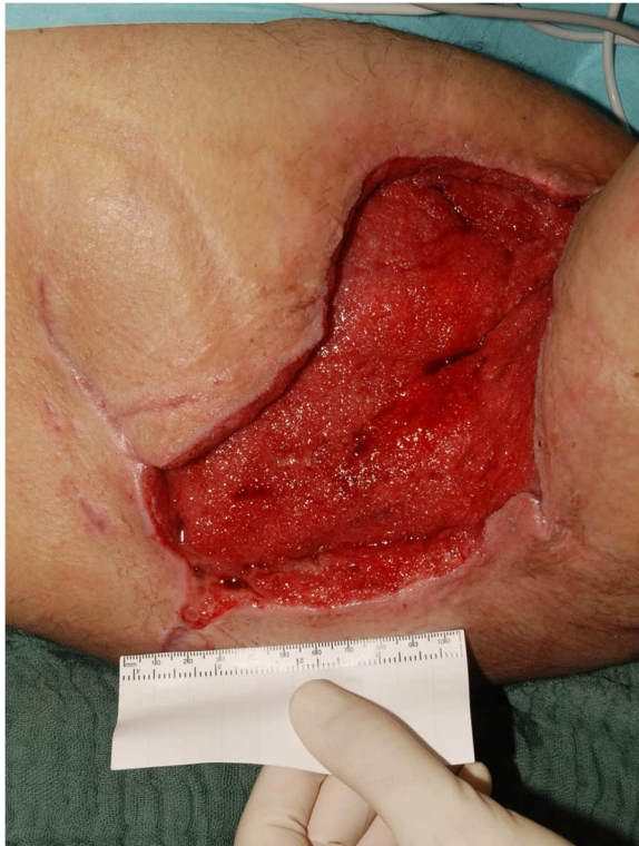
Figure 2 The resulted defect after wide surgical excision.