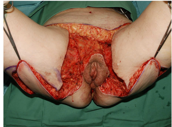
Figure 8 Bilateral transposition flap used to cover large defects bilaterally.

of the vulva and the anal sphincter. For lesions located in the gluteal and the trunk area, skin grafting was used successfully.