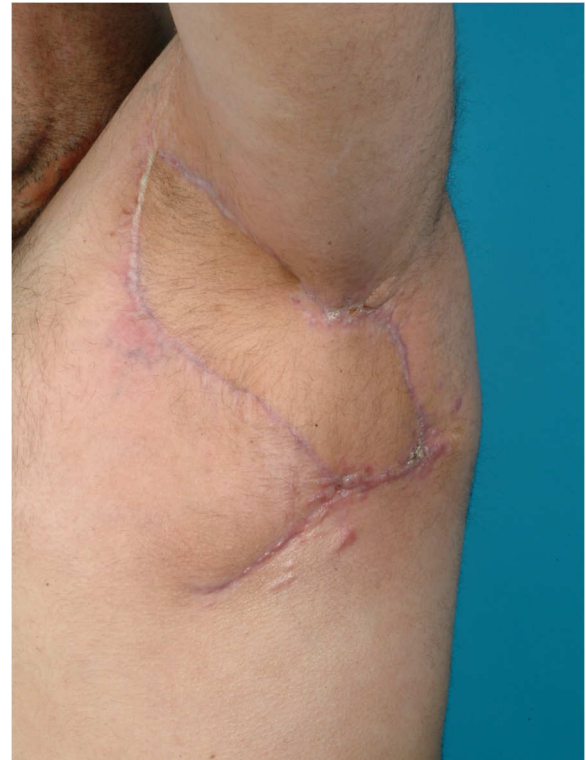
Figure 4 Post-operative photo demonstrates no healing abnormalities.

and showed good functional as well as aesthetic results (Figures 1, 2, 3, and 4).