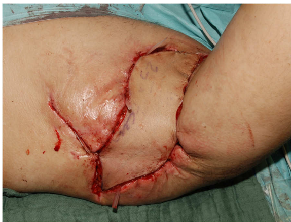
Figure 3 Adaptation of the ALTP flap after vascular anastomosis.

For lesions located on the perianal and the perineal regions, several techniques have been carried out including the use of bilateral transposition flap (Figures 5, 6, 7, 8, and 9) or the using of Gracilis musculocutaneous flap for severe lesions. Both techniques required preservation