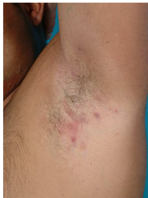
Figure 1 Hidradenitis suppurativa (Hurley's Staging II) in the left axilla.

Reconstruction of the axillary region included several techniques but primary closure and skin grafting were not performed based on expected complications such as contractures, excessive scarring. For those lesions in this area, rotation fasciocutaneous flap and transposition fasciocutaneous flap such as Limberg flap were performed successfully and showed good aesthetic as well as function results. Parascapular fasciocutaneous flap and even thoracodorsal artery perforator (TDAP) flap were selected for moderate to diffuse lesions. Massive lesions in the axillary region were reconstructed in 1 of our patients by the use of free (microvascular) tissue transfer in the form of anterolateral thigh perforator (ALTP) flap