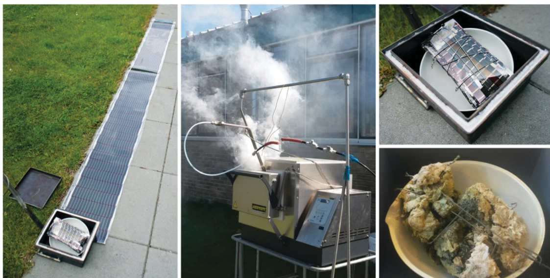
Fig. 1 Left: Picture of 1 m 2 of an organic solar cell rolled out on the ground. On the bottom left of the same picture an additional 1 m 2 has been cut into smaller pieces, tied up with heat resistant steel wire and put in a ceramic bowl inside the steel container. Middle: Picture of the oven setup with the steel container placed inside the high temperature oven with a controlled air flow. Right: Pictures of the cut up solar cells before and after incineration.